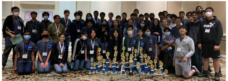
Baton Rouge Magnet High School, Baton Rouge, LA