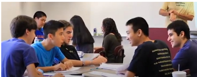
Snapshot from the video, Buchholz HS submitted