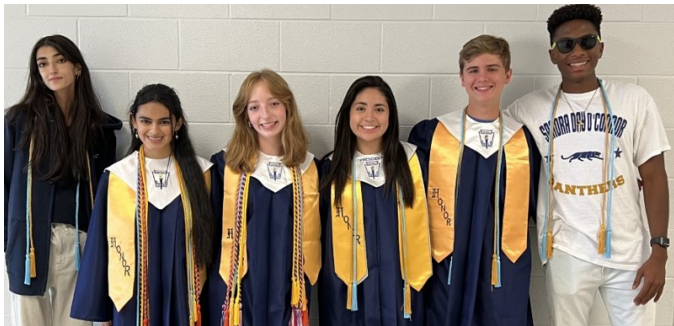
Sandra Day O'Connor High School, Helotes, TX