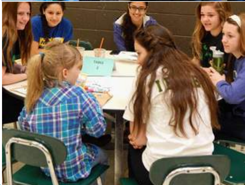
Bottom: Brewster High School Mu Alpha Theta students engaging with the third graders to help solve math problems.