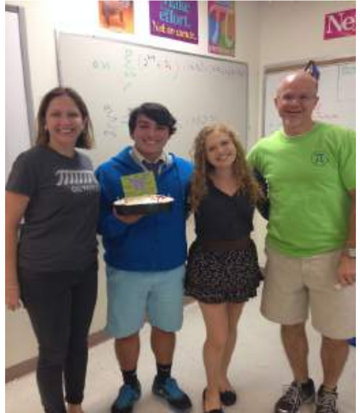
The above photos are from Saint Andrew's School in Boca Raton, FL.