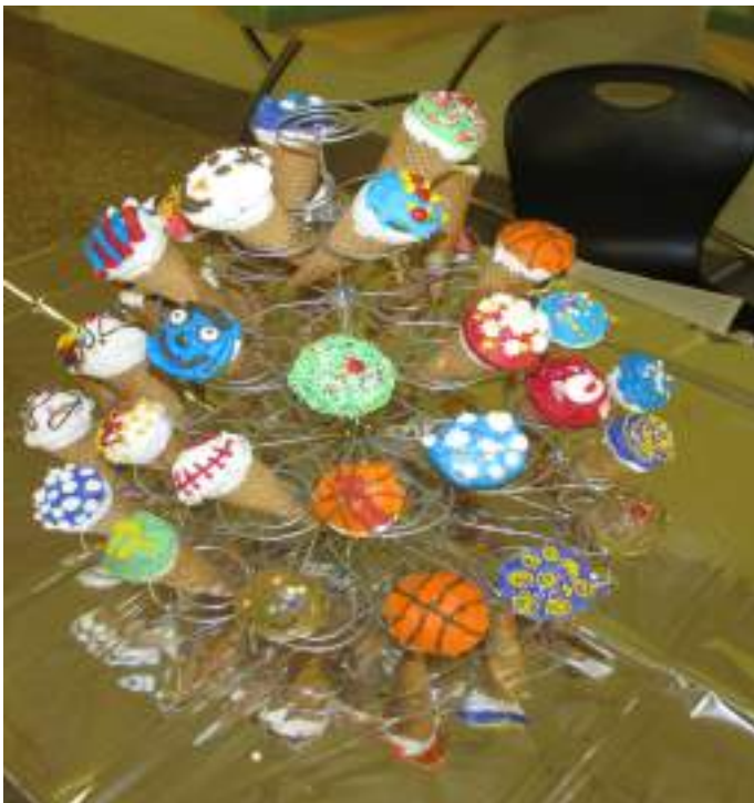
The above picture is from New Mexico Junior College. They partnered with the Community Coalition on Drugs in Lea County for their Pi Day Celebration. The picture is Cone Cakes: Sugar cones with Miniature cupcakes.

Thank you to all those who have shared your activities with us. For full details on these Pi-Day Celebrations, see the online blog section of our website.