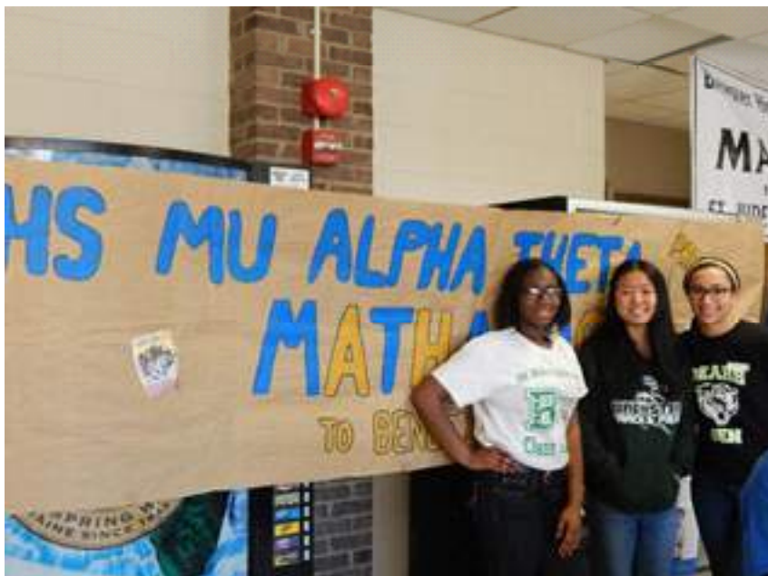
Top: Brewster High School Mu Alpha Theta students welcome the third-graders

Over the past three years, the Mu Alpha Theta has raised over $12,000 for St. Jude's.